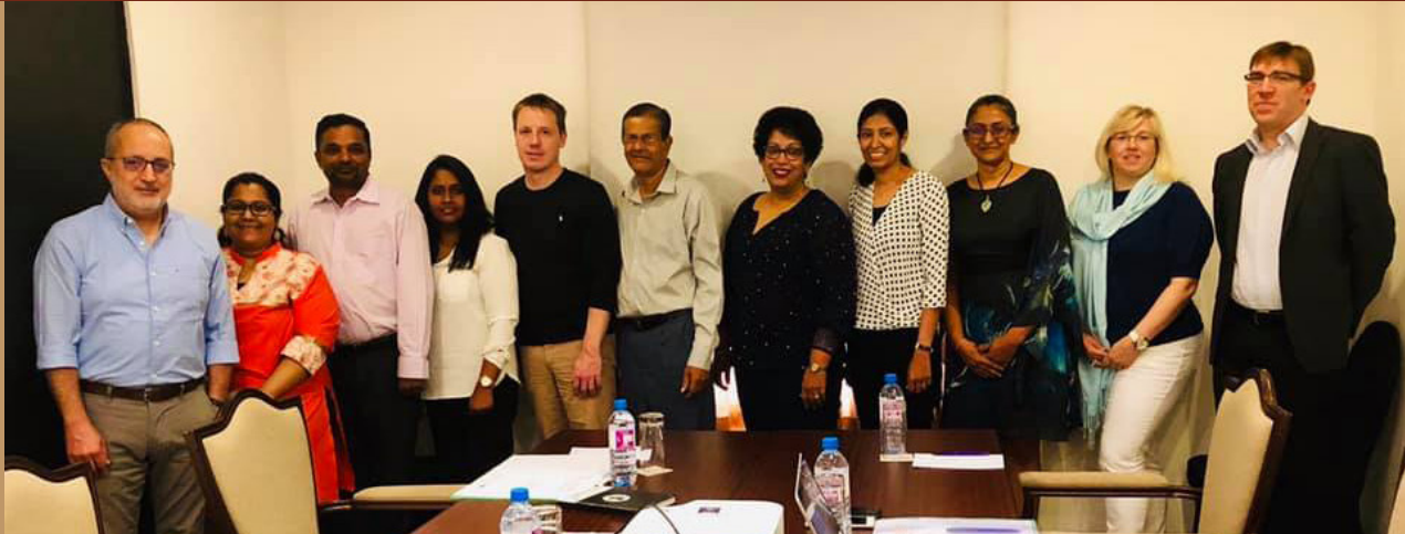
Photograph: Representatives from 5 institutions involved in the REGARD project at the project kick-off meeting in Colombo on January 2019

REGARD (REbuildinG AfteR Displacement), is a collaborative research project co-funded by EU Erasmus+ programme. This three-year research initiative aims to develop competencies in rebuilding communities following disaster and conflict induced mass displacements from the perspective of the built environment.