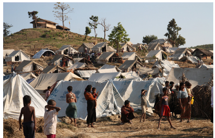
Photograph: People displaced in Rakhine State, western Burma.

Socio-cultural needs are related with the social challenges of the displaced communities such as disruption to the community and cultural life, reduced access to basic needs (Food, Clothes, Water), health problems, interruption to the education, aggravation of safety and security concerns, etc.